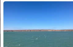
First glimpse of the Kimberley coast