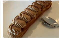
The first cake of many!