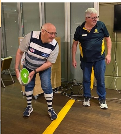
Rotarians trying their handball skills